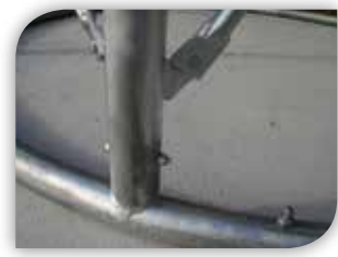
Cert galv frame