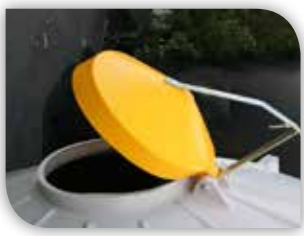
Top lid- self closing