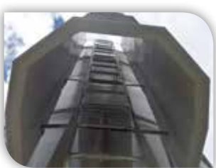
Ladders & Cages